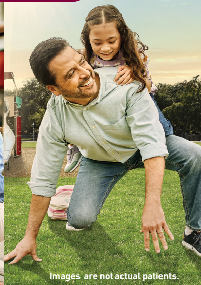
Images are not actual patients.